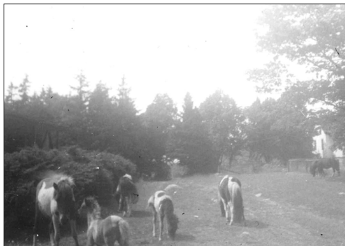
Ponies grazing on McNabs Island