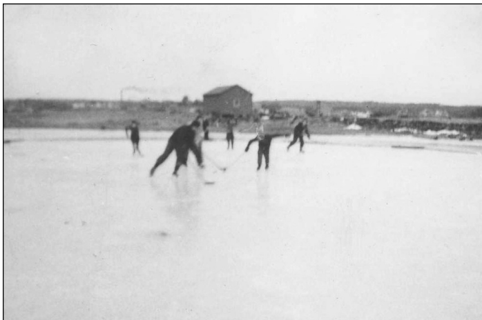
Pond hockey, Ives Point Pond in 1937