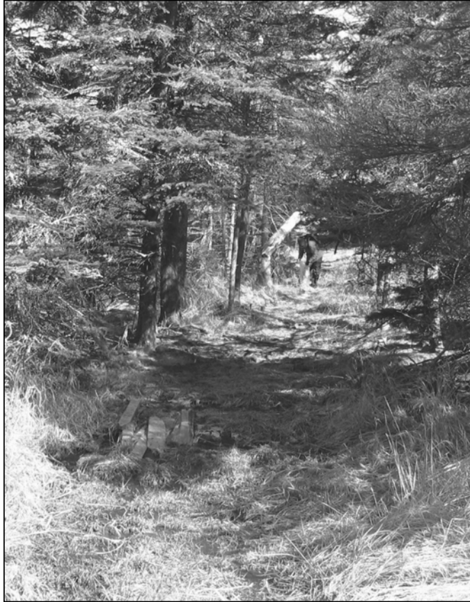
A French drain will be installed to take water off wet areas, like those pictured, on the Colin Stewart Trail.

This Colin Stewart – Brow Hill trail loop will allow visitors to visit Fort McNab, which reopens this spring following an expensive make-over by Parks Canada, and return to Garrison Road via Brow Hill and the Colin Stewart trails. Eventually we hope to install park benches along this trail loop so that visitors can stop to appreciate the scenery near the McNab homestead, McNabs Pond and Halifax Harbour.