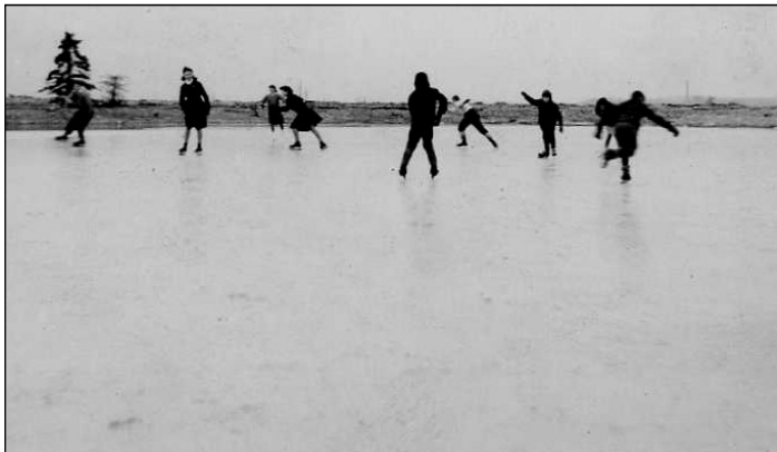
Skating on Ives Point Pond in 1944